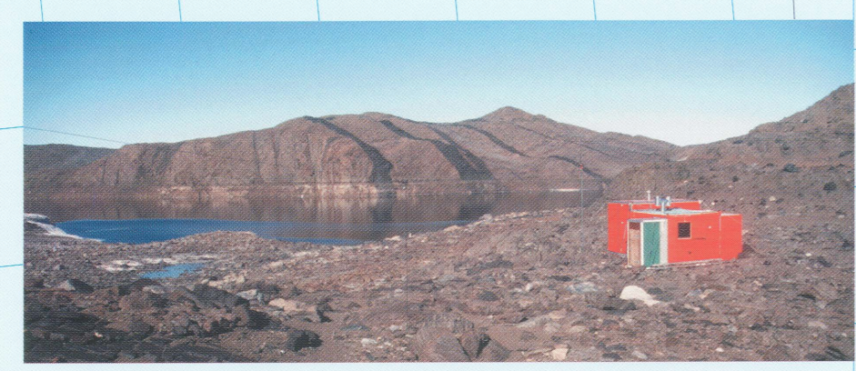
WATTS HUT: Viewed looking south west over Watts Lake. The hut is located on the saddle between the north eastern shore of Watts Lake and Ellis Fjord.