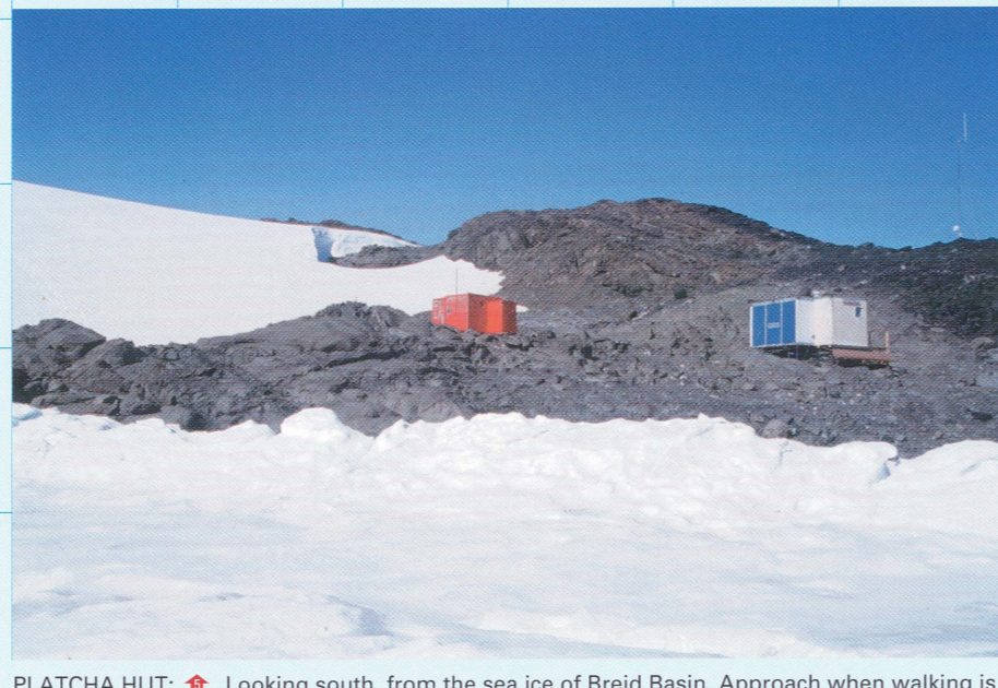
PLATCHA HUT: Looking south, from the sea ice of Breid Basin. Approach when walking is over the saddle, directly behind the blue hut.