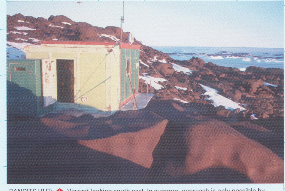
BANDITS HUT: Viewed looking south east. In summer, approach is only possible by helicopter. In winter, approach is from the sea ice to the south west.

Following the ratification of the protocol on Environment Protection to the Antarctic Treaty (MADRID PROTOCOL), Sites of Special Scientific Interest and Specially Protected Areas are to be designated as "Antarctic Specially Protected Areas". Entry to all these areas requires a permit. Water levels for lakes above or below sea level, are for January 1996. Coastline, rock/ice interfaces, contours and spot heights have been derived from ANARE aerial photography dated February 1997 and January 1994. CAUTION: Absence of the depiction of crevasses does not necessarily indicate a crevasse-free area.