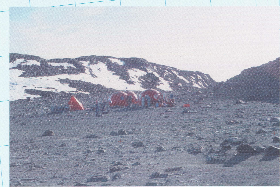
MARINE PLAIN APPLES: Located at the north western corner of SSSI 25. Viewed looking east. When walking in summer, the approach is generally via Ellis Rapids and along the well defined valley that parallels Ellis Fjord. This valley is visible behind the apples in the photo.