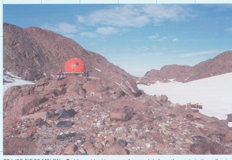
TRAJER RIDGE MELON: Viewed looking west. Approach is from the east via the valley in the centre of the photo. (Photography - Andy Cianchi - photo 2624 C2)