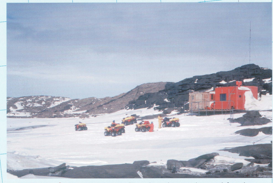
BROOKES HUT: Viewed looking east. Photo shows the general approach from the west. (Photography - Andy Cianchi - photo 2614 C3)