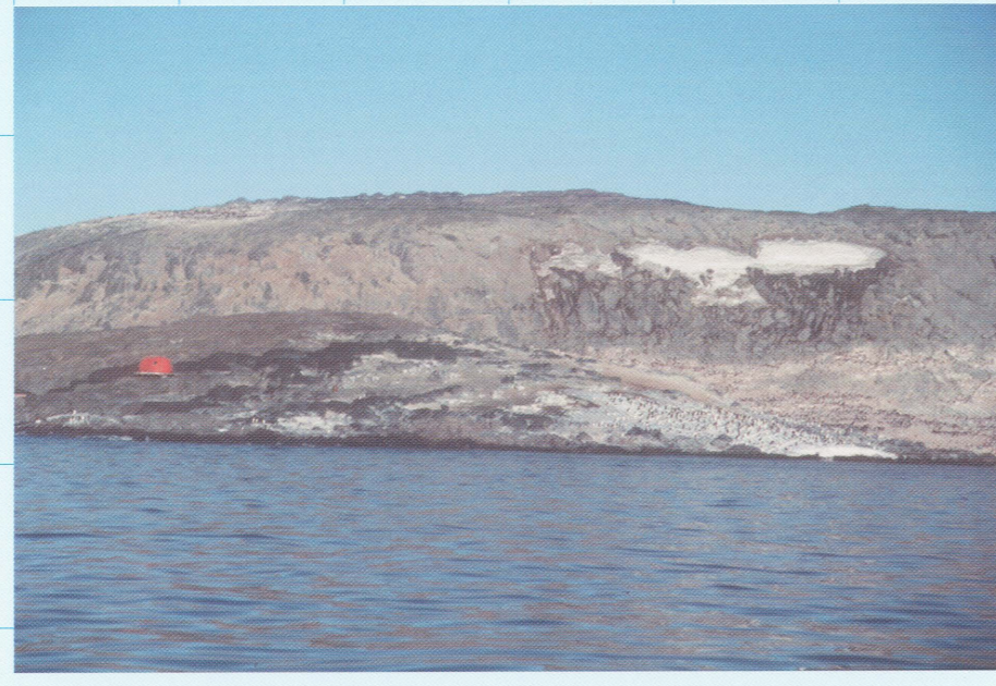
MAGNETIC ISLAND APPLE: Located on the south western side of the island. The photo shows the approach by boat from the south. Suitable landing areas are on rocks below the apple.