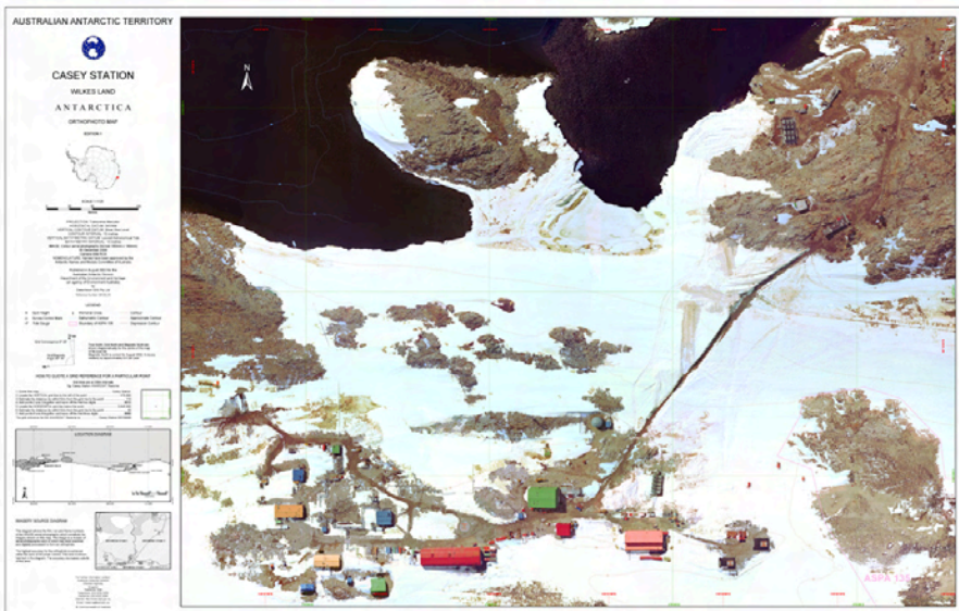
A large scale map of Casey station, available for downloading from our Map Catalogue