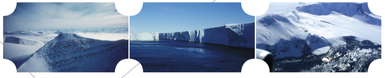
A peak in the ANARE Mountains Mertz Glacier Tongue Lady Newnes Bay (near Aviator Gl.)